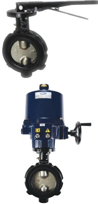
Actuated Butterfly Valve